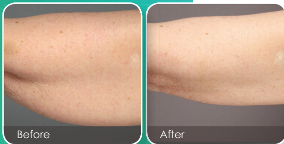
Post 5 Mo 1 Tx